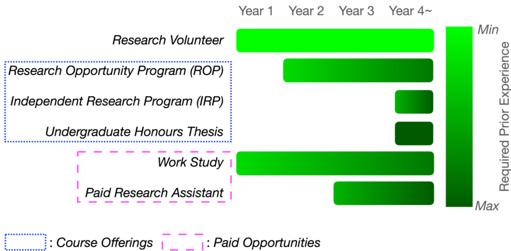
Figure 1. Course-based and paid research opportunities in the UTM Psychology department.

In general, more advanced research opportunities require prior experience. It is helpful to think of research opportunities as building on each other as you develop more proficiency with research (e.g., see Figure 1).