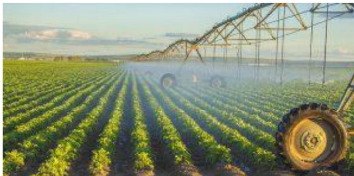
Figure 1: NH 3 fertilizer application to a cropland

Ammonia (NH 3 ) is the most abundant alkaline gas in the Earth's atmosphere. Its emission into the atmosphere surged in the 1910s following its commercial production as an agricultural fertilizer. The use of NH 3 as a fertilizer has allowed humankind to produce larger crop yields and a greater abundance of livestock than would have been possible otherwise. Despite these benefits for food security, the increased production of NH 3 has perturbed the natural nitrogen cycle and particularly has influenced the chemistry that occurs in our atmosphere.