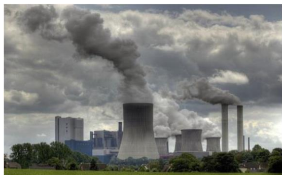
Figure 2: Emissions from a coal power plant

Acidic gases like HCl can be emitted into the atmosphere from a variety of sources, however the dominant source in many areas worldwide is from the burning of coal for electricity production. Its reaction with NH 3 shown above is a reversible reaction, therefore it can be considered only a temporary reservoir of NH 3 rather than a permanent sink. Even even after its reaction with HCl, NH 3 can continue to travel throughout the atmosphere and influence chemical reactions.