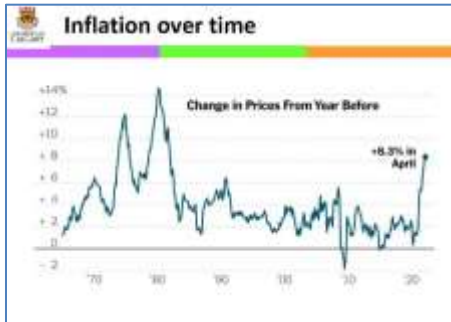
FIGURE 2: U.S. INFLATION: 1970s TO APRIL 2022