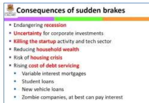
FIGURE 4: CONSEQUENCES OF THE U.S. FEDERAL RESERVE’S SUDDEN BRAKING

For other countries, rising US interest rates mean the US dollar strengthens, but other currencies weaken and their cost of capital increases. Other countries, including Canada, • must raise interest rates to prevent capital outflows and reduce currency devaluation • pay more for commodities and imports • experience increased likelihood of higher inflation, unemployment, recession, and social unrest, and • risk borrowing from and buying from