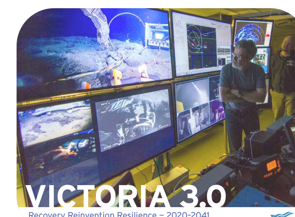
City of Victoria Resilience Plan