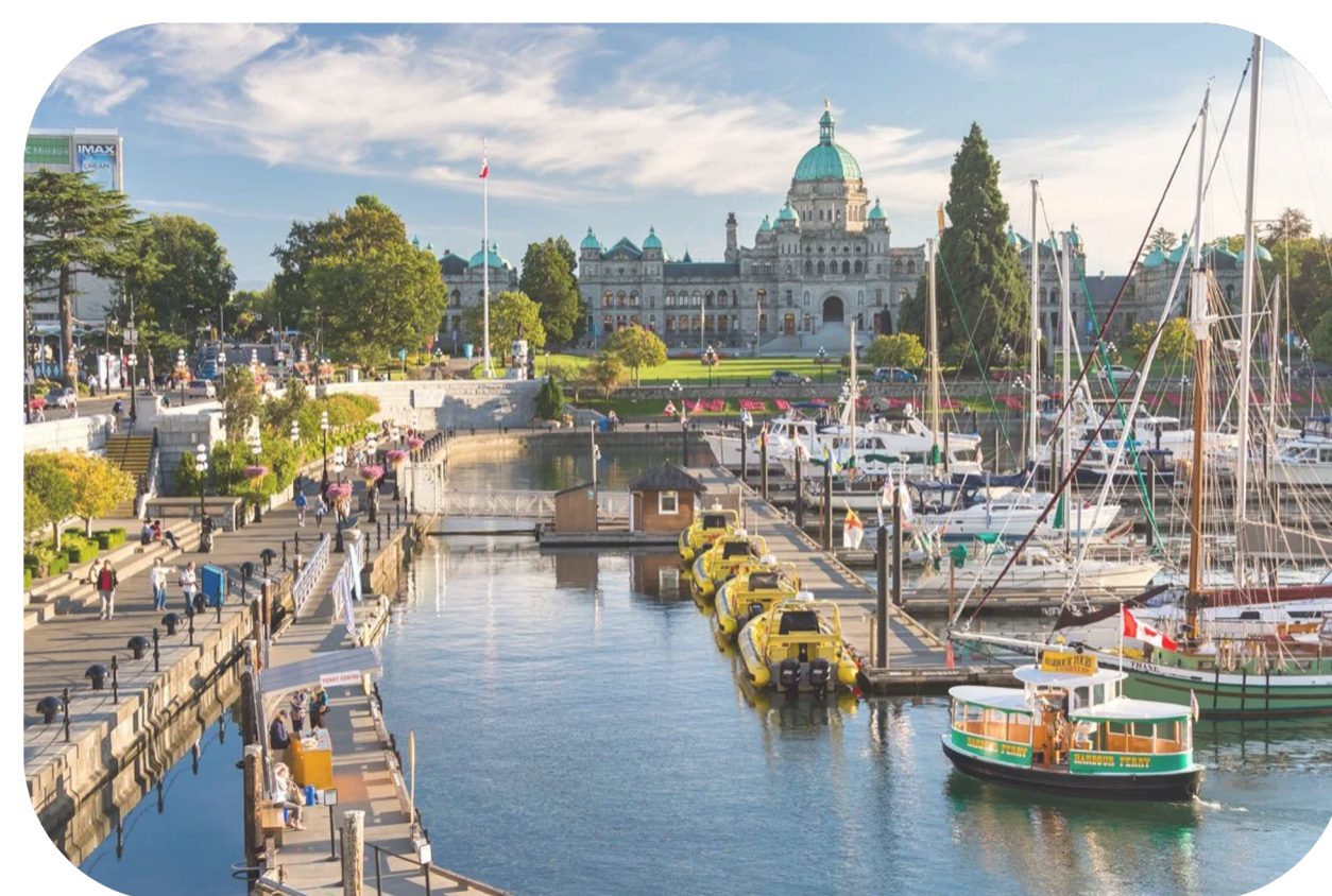
Greater Victoria, Canada