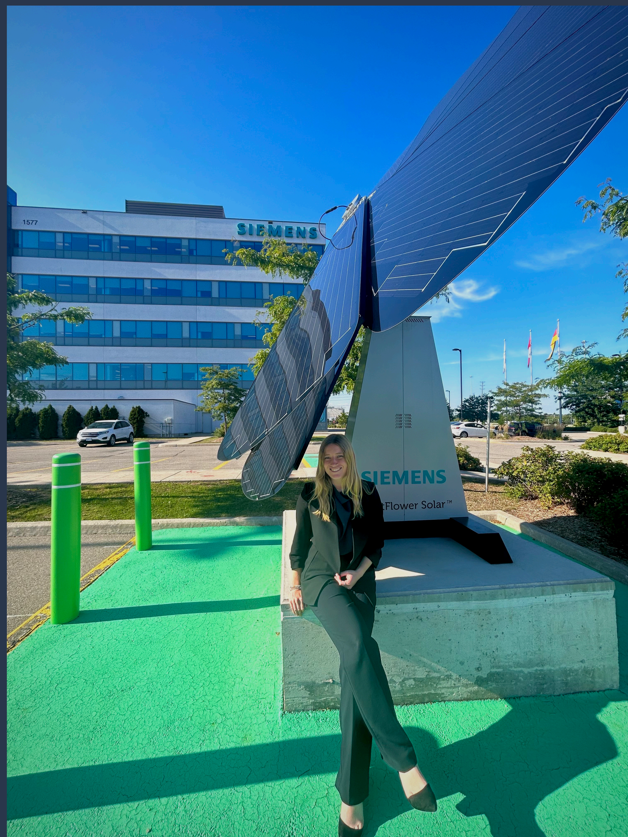
Siemens Smartflower Microgrid