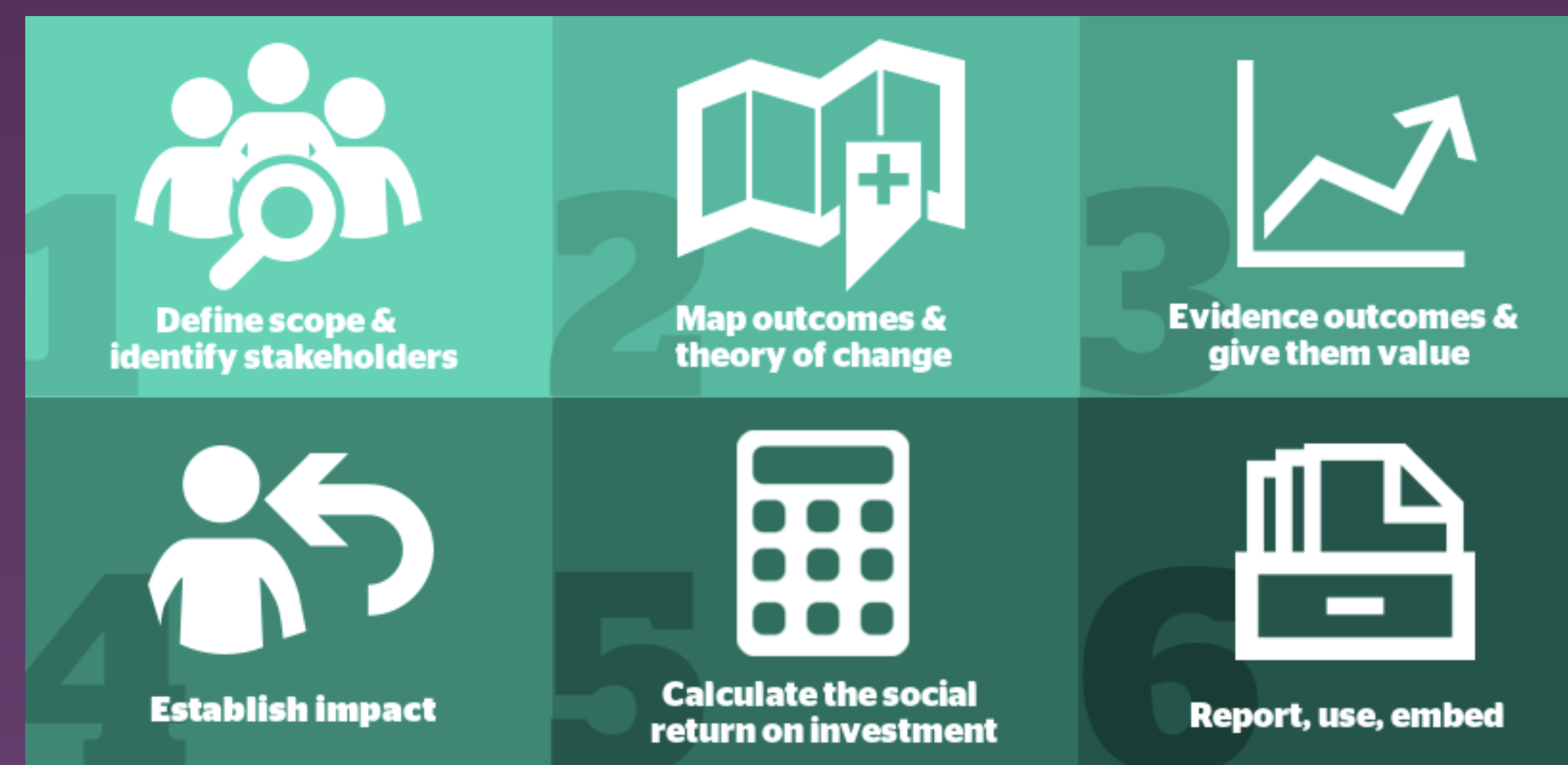
The six general steps of an SROI evaluation.

Developed from traditional cost-benefit analysis and social accounting, SROI is a participative approach that is able to capture the monetary value of a wide range of outcomes. An SROI produces a narrative of how an organization creates value in the course of making change in the world, and provides a ratio that states how much social value ($) is created for every dollar of investment.