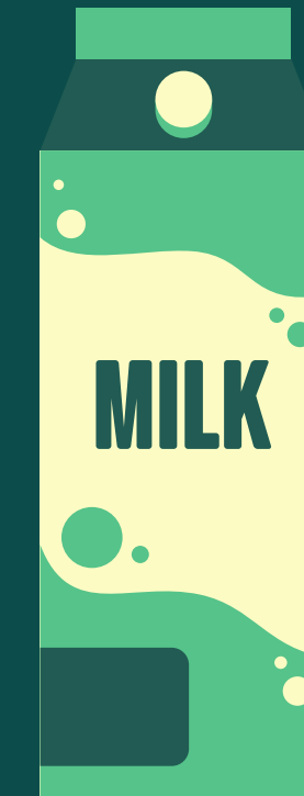
Milk/ Creamer Containers