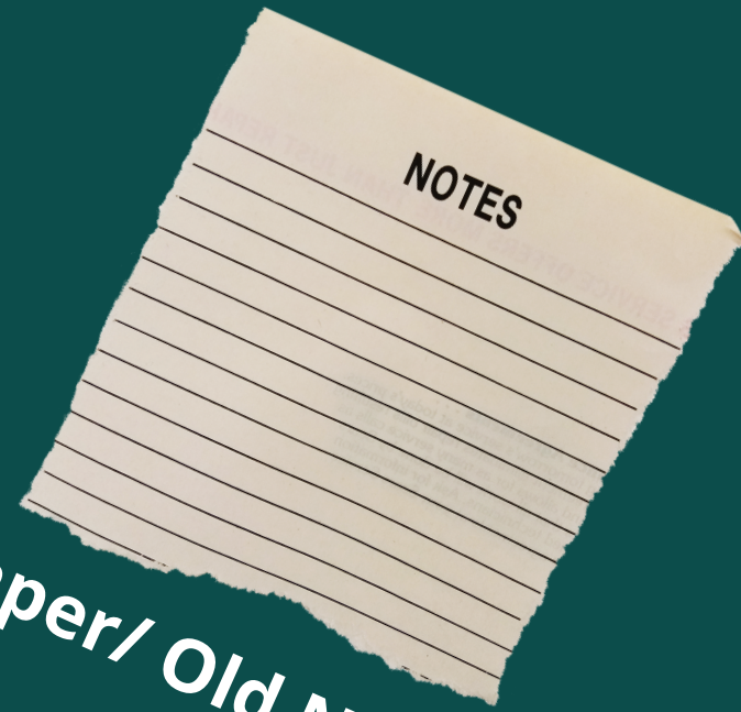
Paper/ Old Notes