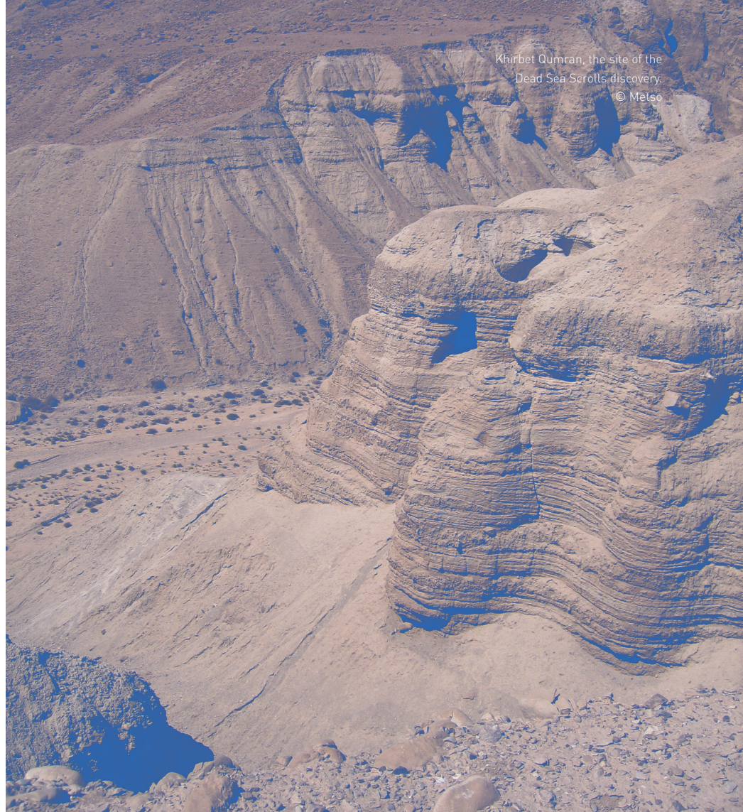
Khirbet Qumran, the site of the Dead Sea Scrolls discovery.

Much of the complexity is created by the character of the material. Most of the ancient writings are multi-layered documents and compilations of materials stemming from a variety of sources written at different times, anonymously modified and transmitted further by creative scribes. Rather than simply copyists, ancient scribes were active participants