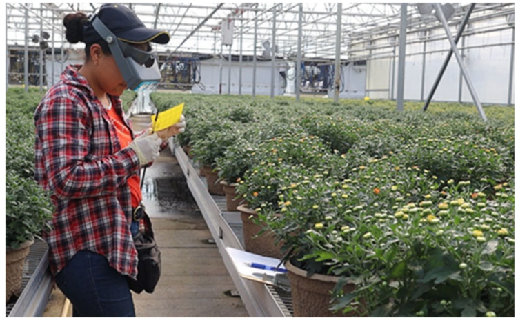
Figure 2. Employee monitoring a sticky card.