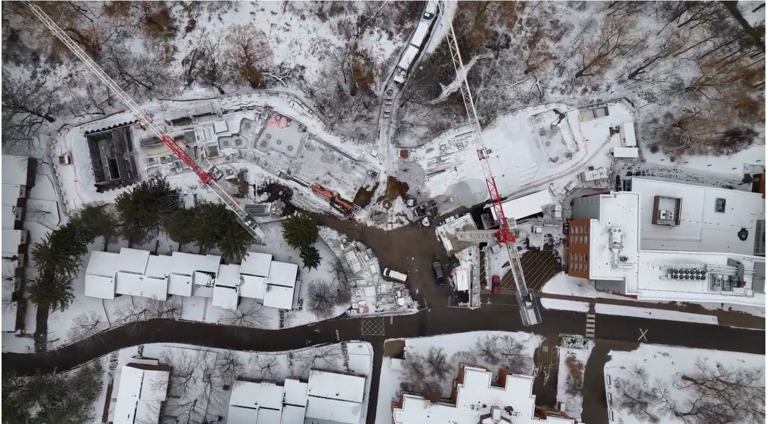
Foundation work in progress for UTM New Student Residence as of January 7, 2025.