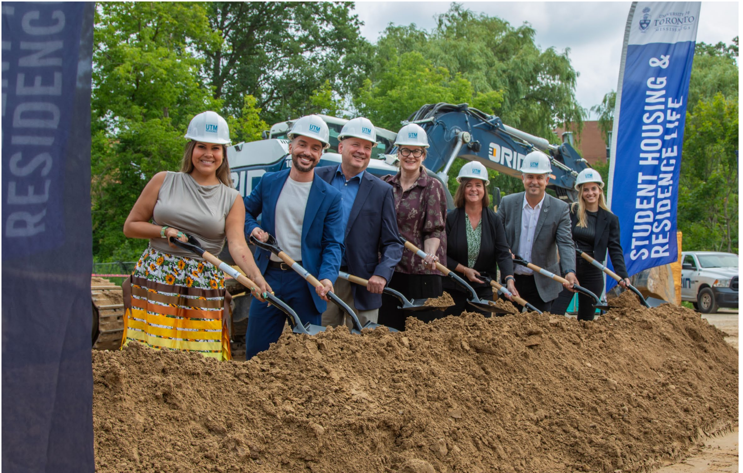
Groundbreaking for UTM New Student Residence Phase IX in July 24, 2024.