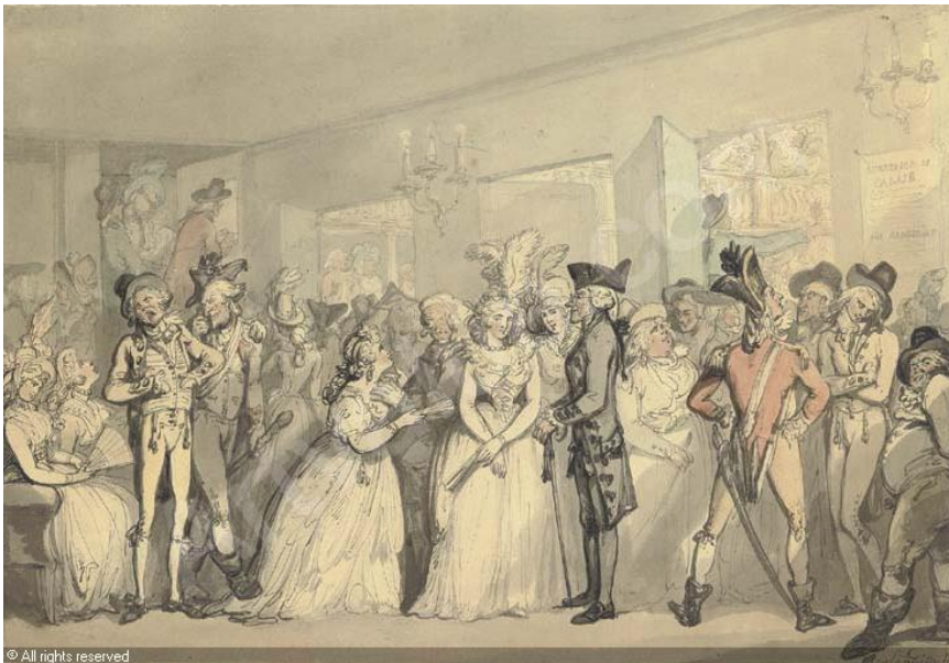
Thomson Rowlandson (1756-1827) Foyer of the Haymarket Theatre