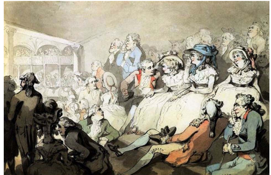
Thomas Rowlandson – an audience at Drury Lane

Home Town: London, ON Other Training: Specialist High Skills Major (Arts and Culture) at H.B. Beal Secondary School For Theatre Erindale: Company - Rebel Daughter ; Front of House Manager - Farndale ; Set Crew Chief - Farndale, A Midsummer Night's Dream, Macbeth Other Companies: Penny - The Gully (UTM Drama Festival); Squealer - Animal Farm (Passionfool); Teacher - The Visit (H.B. Beal Drama Club) Favourite Saying: "In art and dream may you proceed with abandon. In life may you proceed with balance and stealth." - Patti Smith