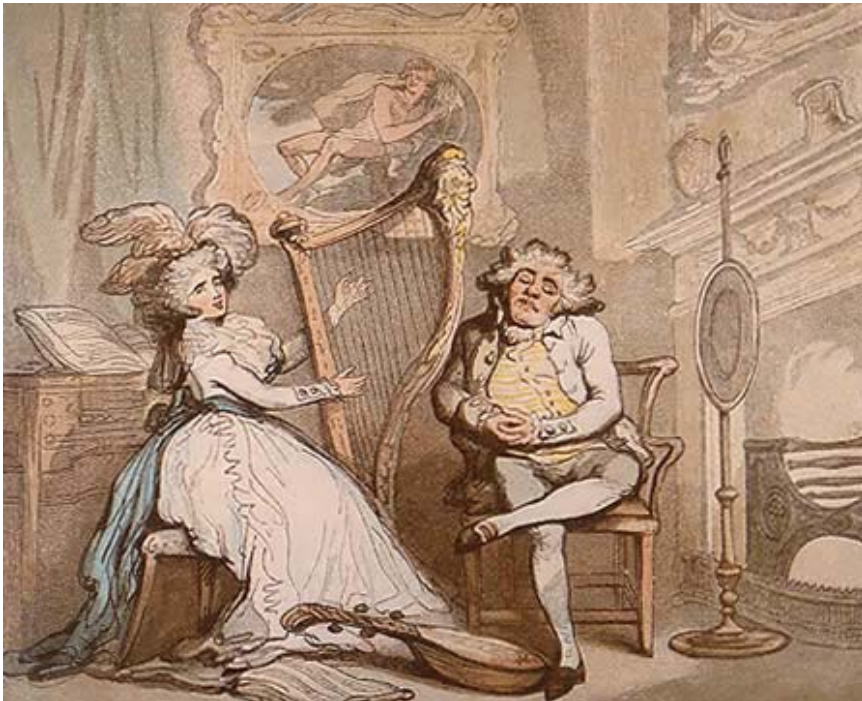
Thomas Rowlandson (1756-1827) Harpist and Husband, 1891