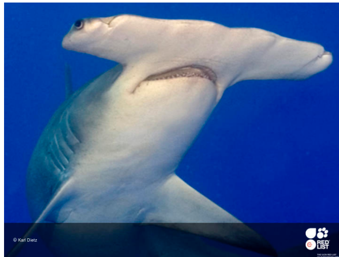
Figure 1: Sphyrna mokarran (Great Hammerhead). Underside of the front half of a Great Hammerhead shark. Note the cephalofoil, making the shark a more efficient hunter.