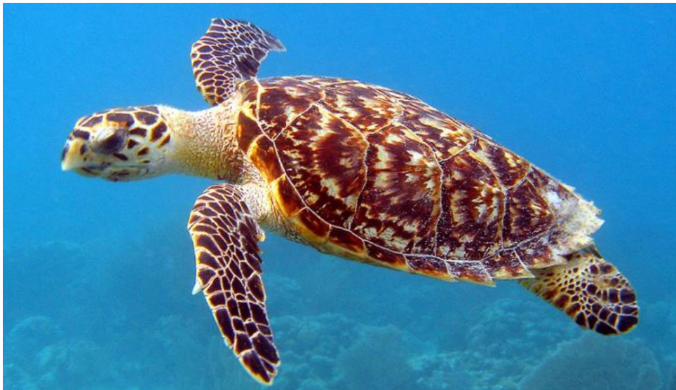
Figure 1. Hawksbill sea turtle swimming underwater. (Photo taken by U.S. Fish and Wildlife Service) (Source: NOAA Fisheries, 1997).