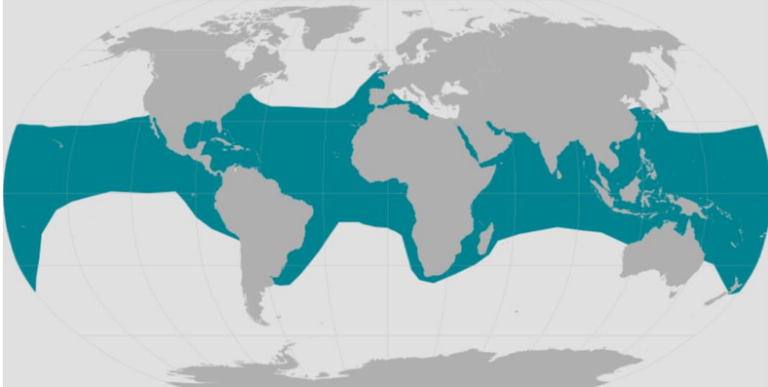
Figure 2. World map providing approximate representation of the hawksbill sea turtle’s living habitats. (Source: NOAA Fisheries, 1997).