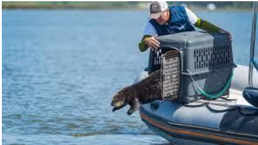
Figure 2: An otter raised in the Monterey Bay Aquarium's surrogate program being released into Elkhorn Slough for the first time (Monterey Bay Aquarium, 2019).