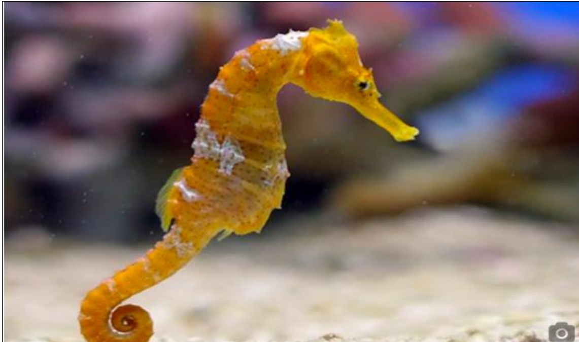
Figure 1, Hippocampus kuda (common seahorse): The image above shows a Hippocampus kuda . Note the structure of the seahorse; it's horse-shaped head, the long snout used for pivot feeding, it's prehensile tail and dorsal fin.