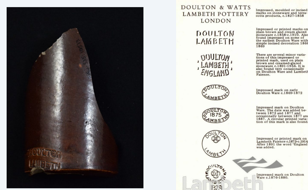
Figure 4. Image of Doulton Lambeth sherd from Schreiber Wood Project (left). Dating chart of Doulton and Lambeth makers marks (Lambeth Archives, 2020, right).

Doulton Lambeth's pottery was originally created in the Lambeth area of London in 1815 where they specialized in pottery and figurines (Perry, 2011). In the case of the Schreiber's collection (Figure 4), the maker's marks were found on the bases of ink bottles used for storing ink. Upon further analysis of the maker's mark, these items can be dated back to between 1858 and 1910. As the Schreiber's came to Canada around 1875, it is possible that they purchased it ahead of time and brought the bottles with them, or they could have been shipped to Canada from England.