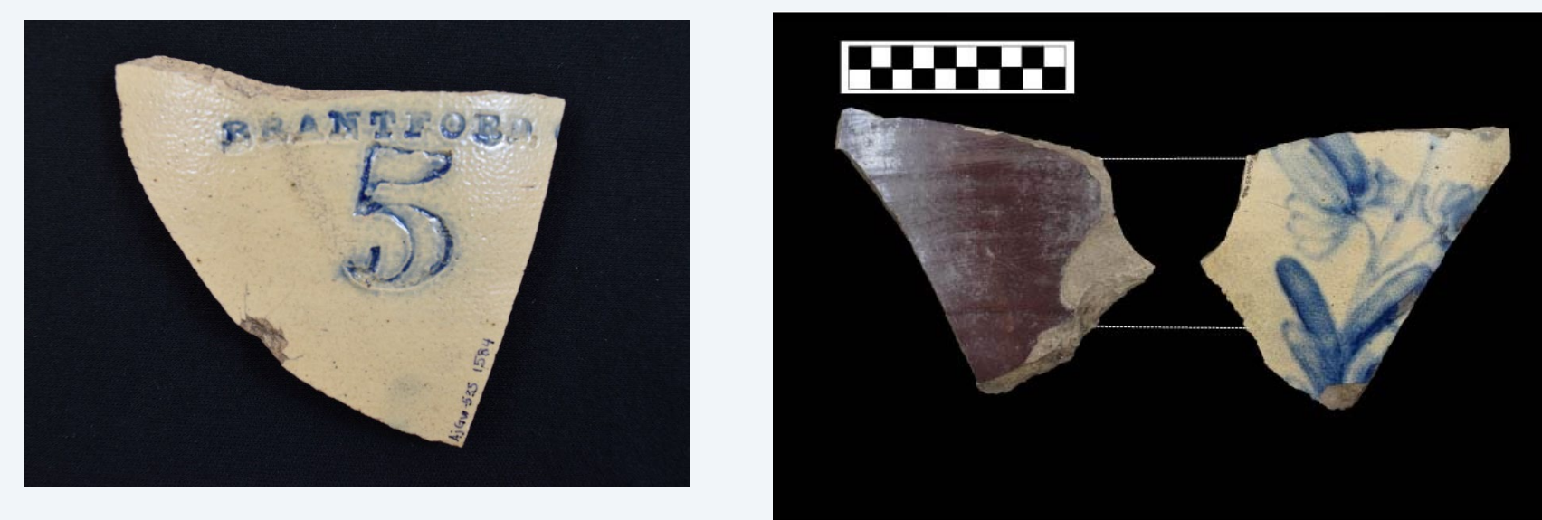
Figure 3. Image of Brantford Pottery from the Schreiber Wood Project

One vendor that was prominent in this collection of ceramics was Brantford Pottery with approximately 4 different vessels. Brantford is one of the earliest manufacturers of stoneware and is considered one of the largest pottery processors in all of Canada. (Webster, 1968). This is based on the large marketing area it dominated along with the great variety of products they had available. These vessels could potentially have belonged to the Schreiber's because of the design that can be seen on the maker's mark on one of our sherds (Figure 3). This would place the date of purchase between the years 1873 and 1894 which lines up with when the Schreiber's were living in Canada. Therefore, it is likely that the Schreiber family would have used these as large storage vessels as the large "5" visible is an indicator of the volume in gallons that the vessel can hold.