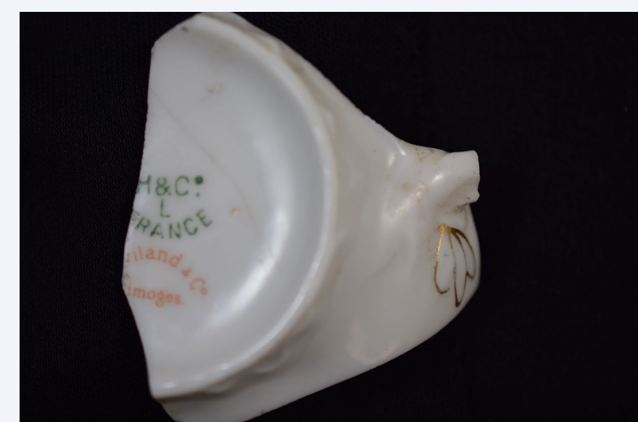
Figure 1. Dating chart based off Haviland Makers Marks (Holland, 2006, left). Image of the sherd from Schreiber Wood Project (right).