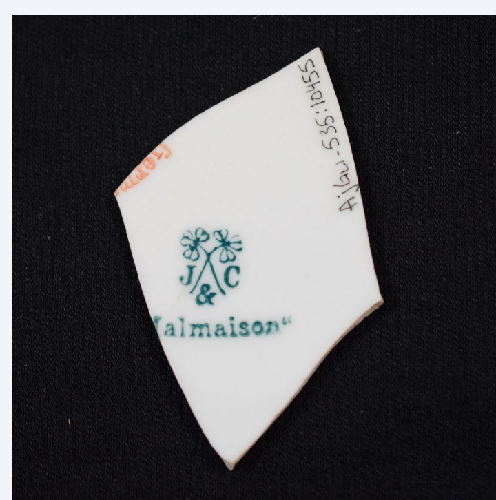
Figure 2. Image of Jaeger and Co. sherd from Schreiber Wood Project

Jaeger and Co. was a porcelain manufacturing company based in Germany that operated from 1872 to 1986 (Marshall, 2004). Throughout this time, transitioned from a small decoration company to a tableware/giftware shop. The maker's mark on the pieces of flatware from our collection (Figure 2) dates this vessel from 1872-1898. There is no sign that these vessels were available for sale in Canada or England, so it is possible that this vessel was brought back, or ordered from, Germany.