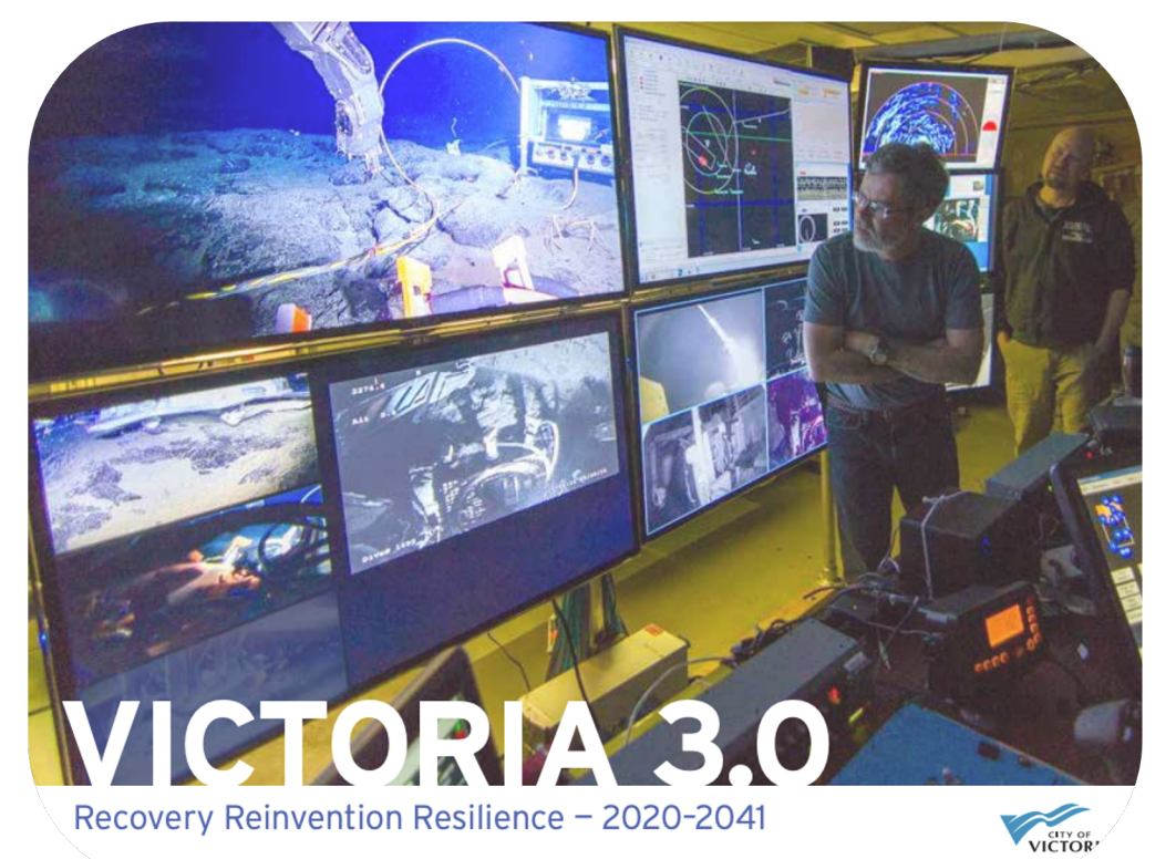
City of Victoria Resilience Plan