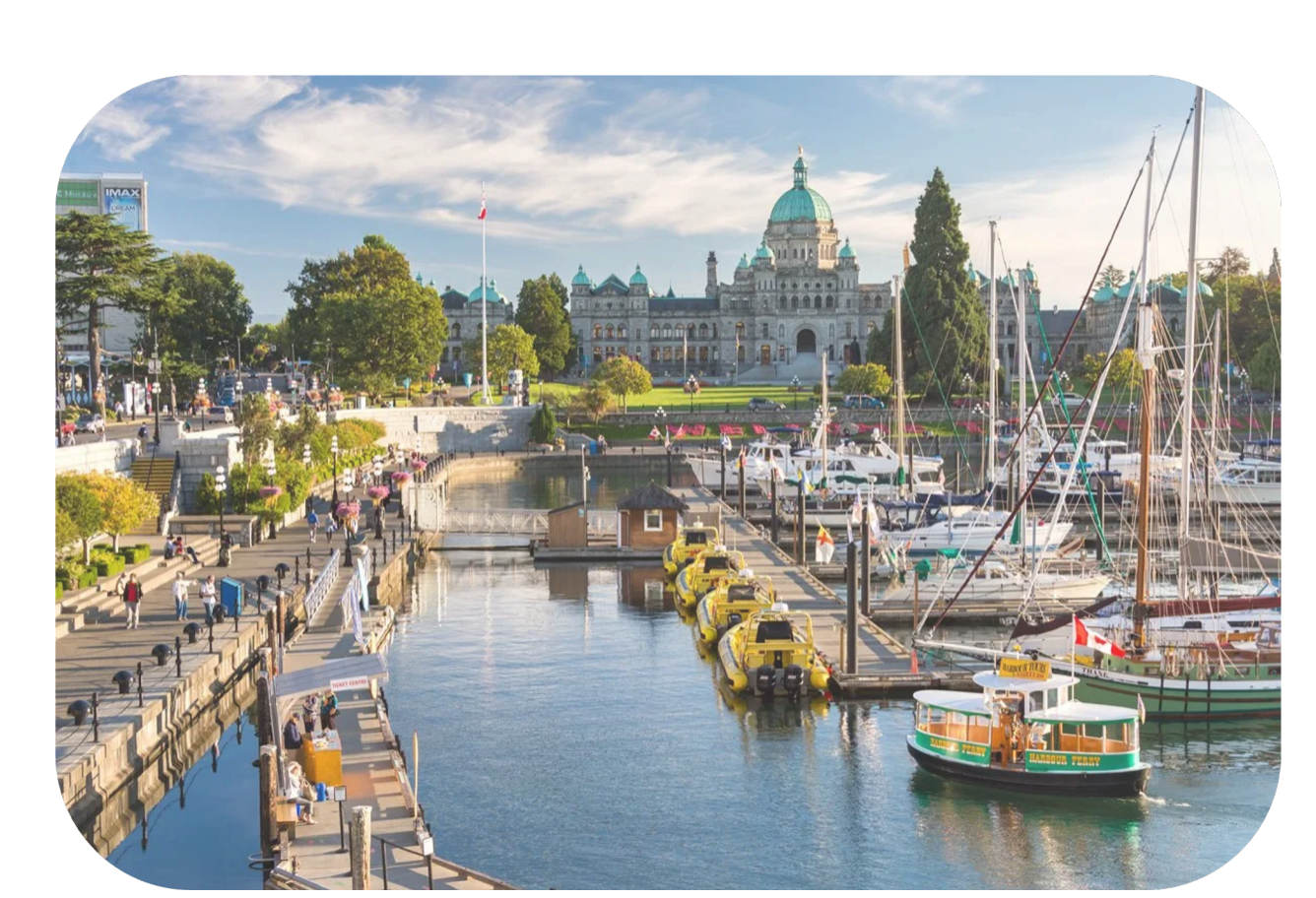
Greater Victoria, Canada